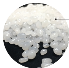
PELLETS Ideal for auto-fed hot melt dispensing equipment

H.B. Fuller hot melt adhesives are available in two forms.