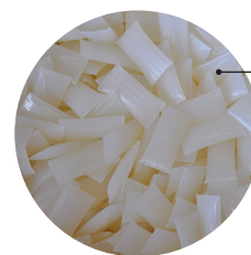
PILLOWS* Ideal for manual handling and scooping into hot melt dispensing equipment, proven to increase melt rate